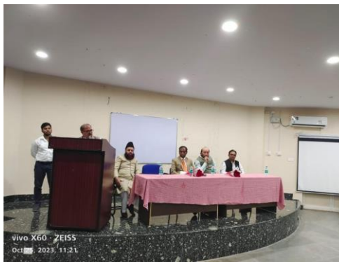
Image: Commencement of Session 2023-24