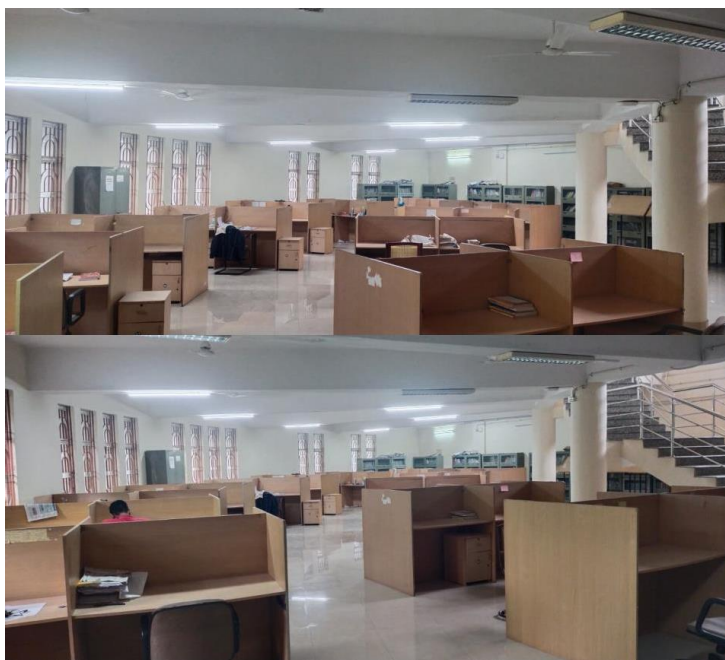
Image : Library

Library: Library is a prerequisite for any academic activity, more so, if it is competition oriented. Realizing this MANUU CSE RCA has set-up its own library. Text books, Reference books, Journals, Magazines and Newspapers in English, Telugu and Urdu etc. are stocked in accordance with needs of the aspirants. Aspirants can also avail, the facilities of the University Central Library.