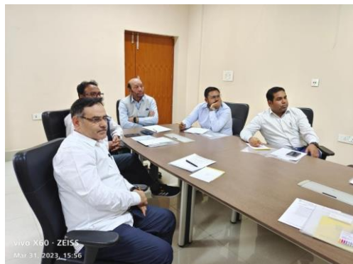
Image: Board meeting with other members joining online